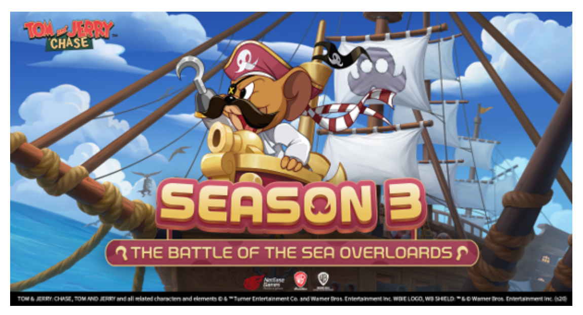
Tom & Jerry Motion Picture Crossover: An Excellent Match of Friendly Rivals!

Season 3 will run from Feb. 5 to May 7. During this latest Season, players can obtain Jerry's S-class Skin "Pirate Leader" and the character Pecos from the Golden Shelf, as well as bountiful amounts of Perk Points, Gold and other items. Additionally, the Jerry S-class Skin "Great Detective" and the new Angel Tuffy character will also become available during this six-month anniversary celebration.